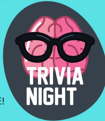
TABLE OF 8 $100 INDIVIDUAL $15

50/50 DRAWINGS LIVE AUCTION SILENT AUCTION TRIVIA ROUNDS BID OR BUY DESSERTS & MORE!